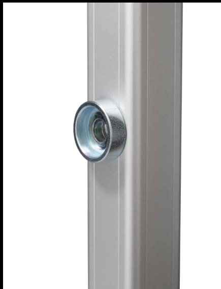
Standard Monoblox Frame