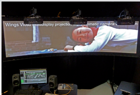
Short-throw projectors fixed on projector arms