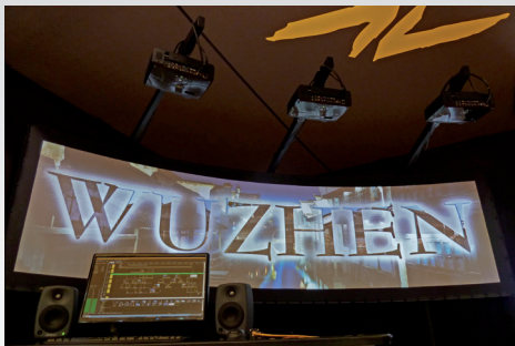
Panorama multidisplay projection

Special requirements demand special solutions. AV Stumpfl developed a mobile projection screen conjoined with a projector mount, which is suitable for use at untypical places. With the stable Monoblox64 profile frame and according projector arms for the installation of short throw projectors directly to the screen, this product is ready for any job. Maximum stability combined with high product durability meet again our system philosophy.