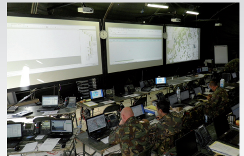
Field operation Dutch Airmobile Brigade

The Desert screen consists of a foldable Monoblox64 frame with automatically engaging snap joints. The special type AT32/64 legs give the screen a perfect hold. The additional anti-sway braces to the frame bottom and center supports secure, despite additional weight load, maximum frame stability. For an easy and flexible mounting of short-throw projectors a specific overhead - projector arm has been designed which can be attached simply and quickly to the back of the frame. The special projector mounting brackets can be positioned stepless along the projector arms according the required distance. The flexible and foldable front projection surface is attached to the frame via snap fasteners quick and easy.